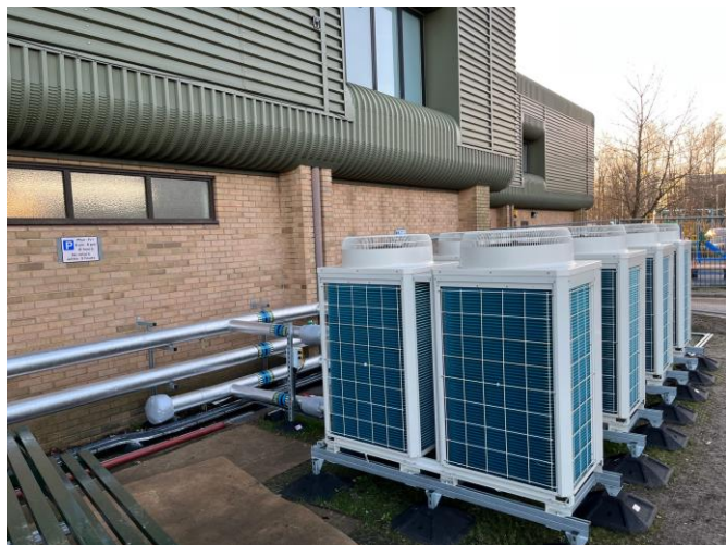
Heat Pumps at Abbey LC